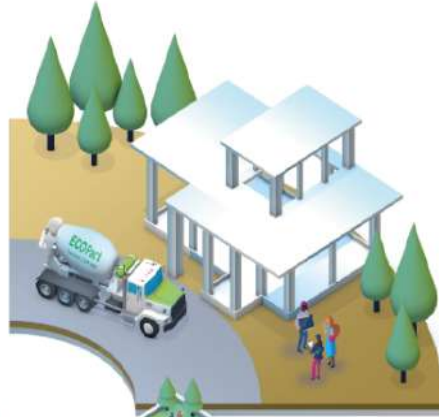
BUILDING BETTER WITH LESS Decarbonizing construction