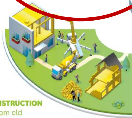
CIRCULAR CONSTRUCTION Building new from old