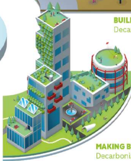
MAKING BUILDINGS SUSTAINABLE Decarbonizing cities