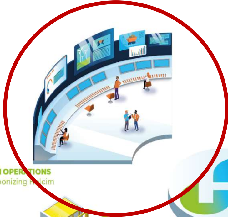
GREEN OPERATIONS Decarbonizing Holcim